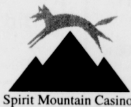
Spirit Mountain Casino

Competitive salary and benefits. Send/fax cover letter and resume to: Garlington Center, 4950 NE MLKing Blvd, Portland, OR 97211 Attn: HR Fax: 331-5956 EOE. Committed to diversity. No phone calls please. Contact our JOB HOTLINE at 727-5947 for additional job opportunities.