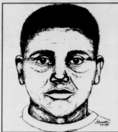
Sketch of serial cat burglar.