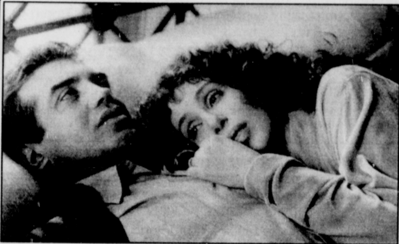
Chazz Palminteri and Cher star in the black comedy Faithful.