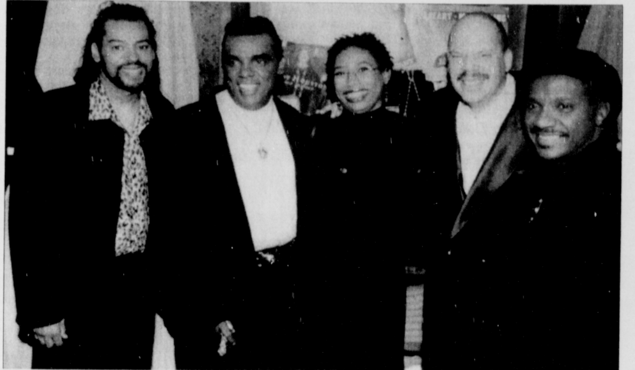
Left to right- Marvin Isley, Ronald Isley, Rachelle Ferrell, Tom Joyner, Ernie Isley Backstage at the Soul Train Music Awards

Ronald also performed on the 10th Annual Soul Train Music Awards in a tribute to Patti LaBelle.