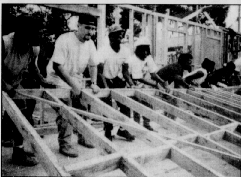
Volunteers construct a local Portland home.

Target employee volunteers will help build a house for a local family this spring in Portland as part of a national partnership between Target