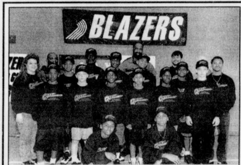
The Portland Police Bureau G.R.E.A.T. (Gang Resistance Education And Training). Joins the already successful Salvation Army Moore Street Center Youth Basketball Program, providing basketball for youth, like those pictured above. For further information 823-2111.