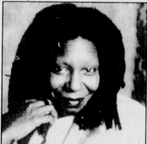
Whoopi and Babyface are two of this year's Essence Award Honorees.