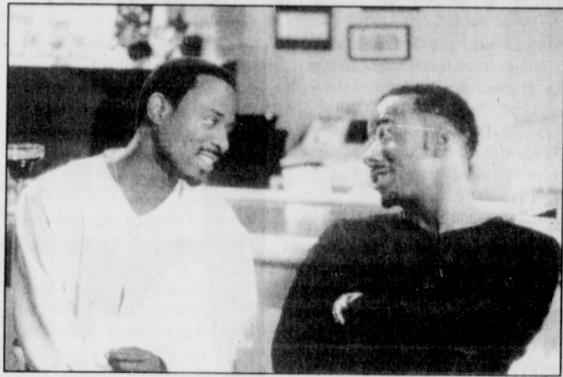
Martin Lawrence stars with Bobby Brown in A Thin Line Between Love And Hate , a stylish blend of comedy, suspense and hip-hop nightlife.

This soundtrack, with its love and relationship themes, serves as the perfect accompaniment to the film's subject-matter surrounding the male/female divide. Directed by Lawrence and produced by the dynamic team