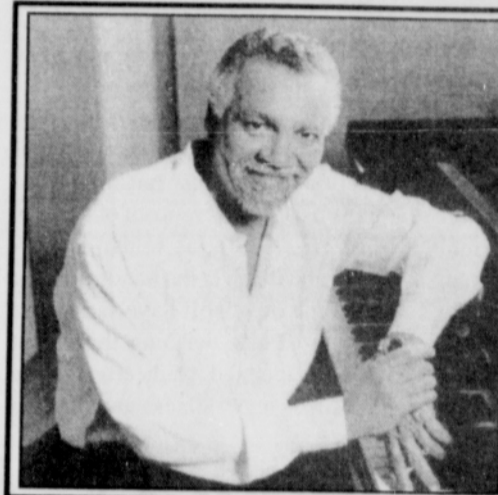
Joe Sample maintains his role as soul searcher, funkaphile and philosopher of the first degree on his Warner Bros. jazz release, Old Places, Old Faces . The Texas-born Sample's sensibilities are rooted in gospel, soul, bebop, blues, Latin and Classical music.

Straw into Gold sings about farming and weaving, homes and heartland, subtle themes of spirituality, the turning of the seasons and the cycles of our lives. Their simple arrangements with sweet triadic harmonies carry you to a heartfelt place. They will be accompanied by violin, concertina and guitar. 100% of the proceeds will go to Portland Habitat for Humanity. A free-will offering will be gratefully received. The concert will be held at Piedmont Presbyterian Church, 5760 NE Cleveland Ave. in Portland and includes a reception for the artists. For more information contact the church at 285-5348.