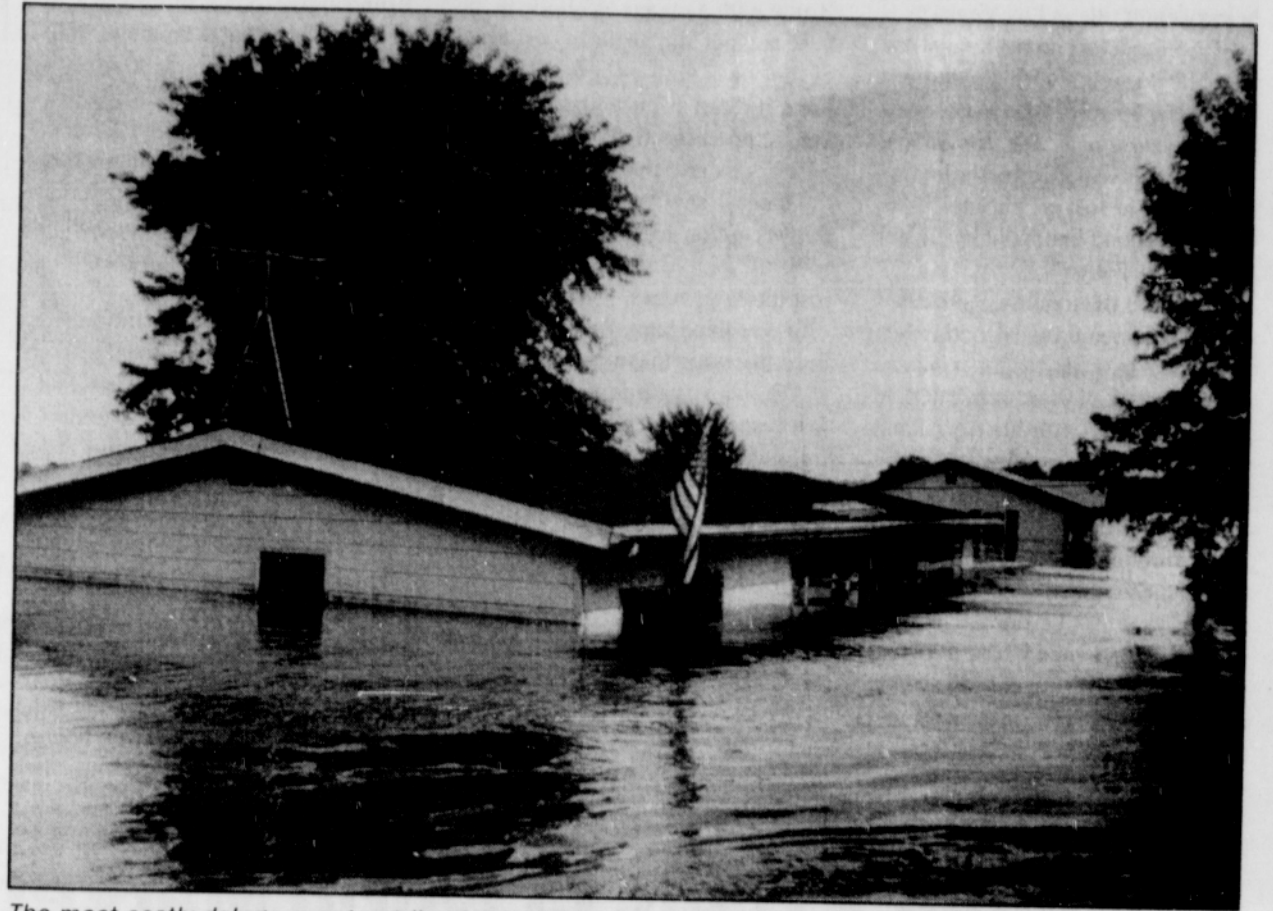
The most costly deluge ever to strike the American heartland is covered on "Flood!", airing on NOVA on Tuesday, March 26, 1996 at 8pm ET on PBS (check local listings).

Local water providers share the concerns of state and federal regulatory agencies on the health risks of lead exposure. If customers have a concern about lead or copper levels in their drinking water, they should contact their local water provider.