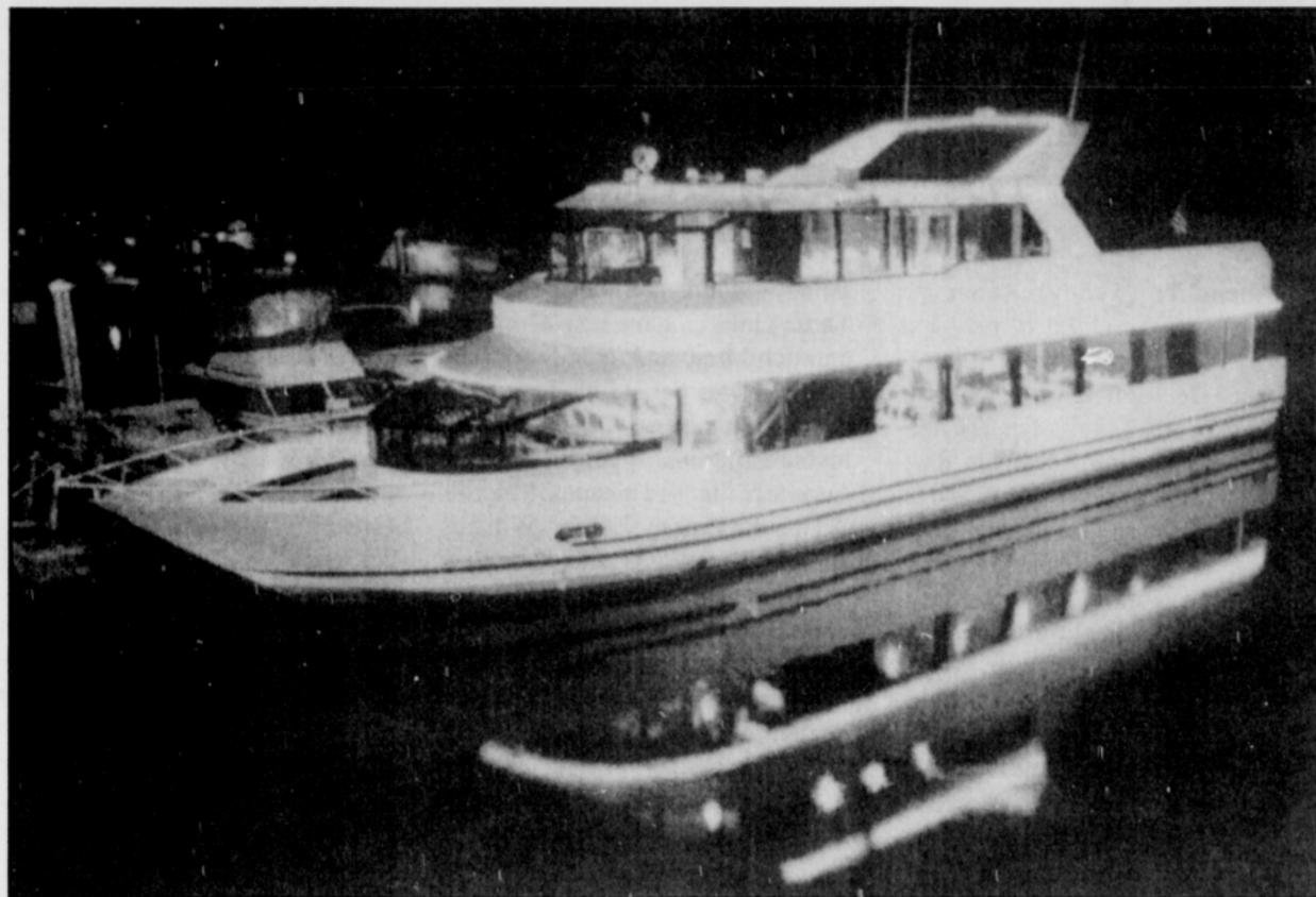
The Willamette Star is the latest yacht to arrive in Portland to provide tours and luxurious dining.

The custom built ship is equipped with two temperature controlled decks, a complete galley, a full service bar, two outdoor viewing decks, elegant interior decor and a sophisticated sound system. For reservations and information call 224-3900.