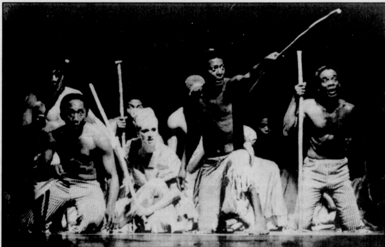
The Cuban National Folkloric Dance Ensemble from Havana will perform at 8 p.m. Friday, March 29, at the Schnitzer Concert Hall, the final date of a two-month cultural exchange. Tickets are available at Ticketmaster outlets.

In 1994, the Gospel Music Association Spotlight award was given to Jars of Clay after they competed in a talent search where over 200 acts vied for the distinction of being the best unsigned band on the scene.