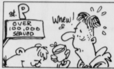
St. Patrick is said to have baptized more than 120,000 persons.

*** Destiny is an invention of the cowardly and the resigned. —Ignazio Silone