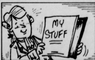
In 1616 Ben Jonson became the first playwright to prepare an edition of his own works for publication.

Best Western Costume Contests will be rewarded for their creativity and a silent Auction and Balloon Sales will be featured at the annual "Casino Night" fund raiser hosted by Community Vision, a nonprofit organization providing living/vocational support for Oregonians with developmental disabilities. The festivities include a Southwest nacho snack-bar, western decor, no-host bar and espresso drinks, and Dixie Land music.