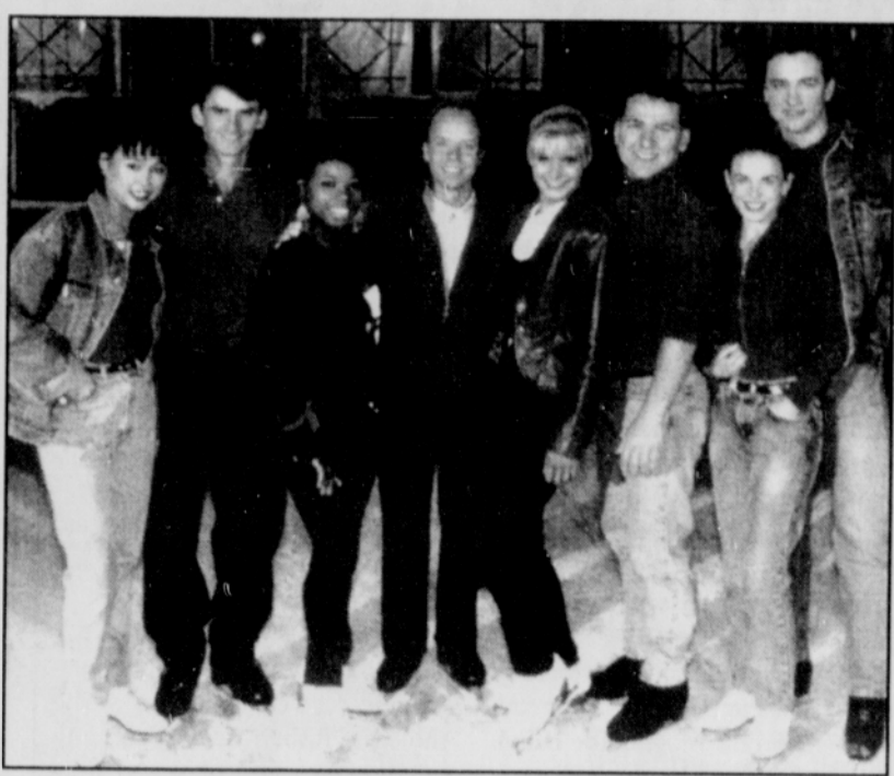
Disney's Champions on Ice," hosted by Scott Hamilton (above center), features the extraordinary talents of champion female skaters Nicole Bobek(left) and Surya Bonaly (right). The show airs in a one-hour special, Saturday, March 9 at 8 p.m. on ABC.