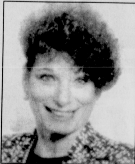
Mayor Vera Katz

"City of Portland employees and citizen volunteers pulled out all stops to prepare for the worst flooding in 30 years," said Portland