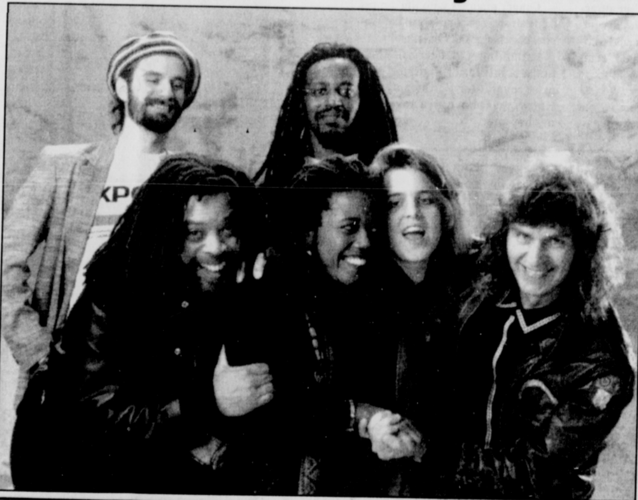
The group Dub Squad will entertain with several other groups during Portland State University's 50th anniversary gala. The college began serving the metro area in 1946 as the Vanport Extension Center.