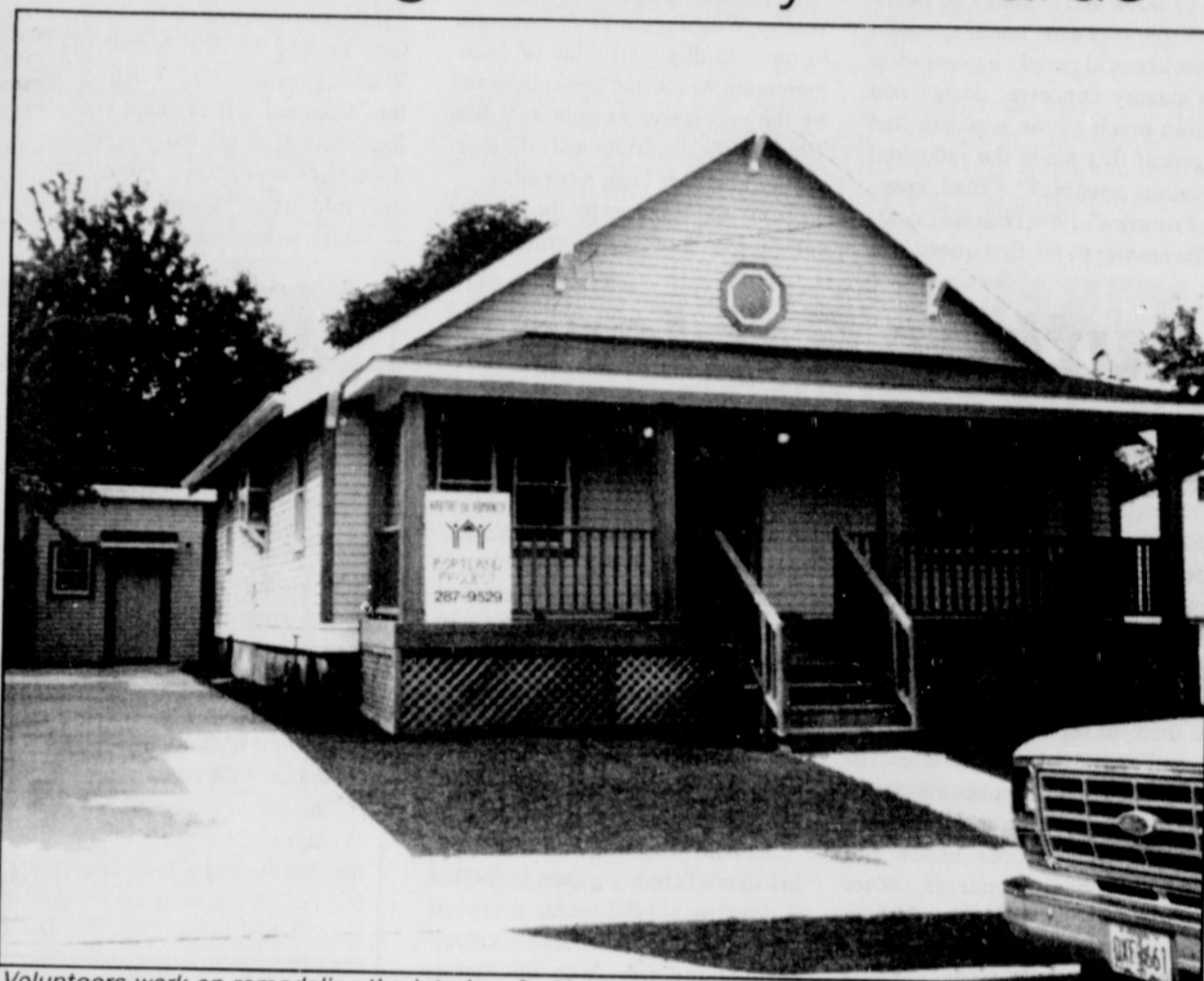
Volunteers work on remodeling the interior of a Habitat for Humanity home (left), while another Habitat home stands proudly finished (above).