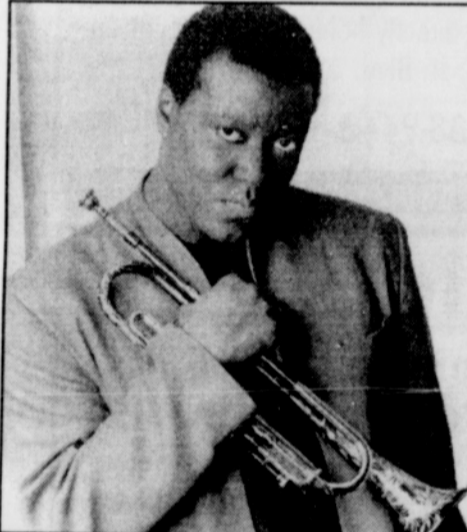
Wallace Roney

Trumpeter Wallace Roney is a rarity in today's jazz world—a young musician/composer/bandleader who has worked his way up through the ranks for over 20 years, earning the respect of countless masters who have paved the way for him and others of his generation. Since age 16, he has worked with the likes of Elvin Jones, Philly Joe Jones and Walter Davis, Jr., in addition to fulfilling three stints with Art Blakey's Jazz Messengers and a long tenure with Tony Williams. In 1993,