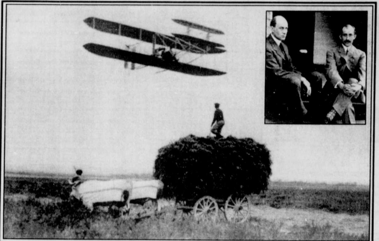
In 1903, Wilbur and Orville Wright solved one of the most baffling mysteries of science - how to fly. It took them another five years, however before they decided to demonstrate their flying machine to the world. When they did, on Aug. 8, 1908 at a race track outside Paris, the Wright brothers were established as the true pioneers of manned flight. The story is profiled on The American Experience: The Wright Stuff, which airs on PBS Monday, Feb. 12 at 9 p.m.

genres of music and continue to do so each and every day. Each and every performance is met with larger crowds and ecstatic responses. 1995 showed Popular Demand great success with their Ep Release (Popular Demand), hit song "Sara Smile". Their CD is selling extremely well, now of which is available at all Seattle record stores both major and independent. Popular Demand is sure to be the most successful R&B group ever to arise from the Northwest. The completed album will be released soon so be sure to keep your eyes and ears peeled.