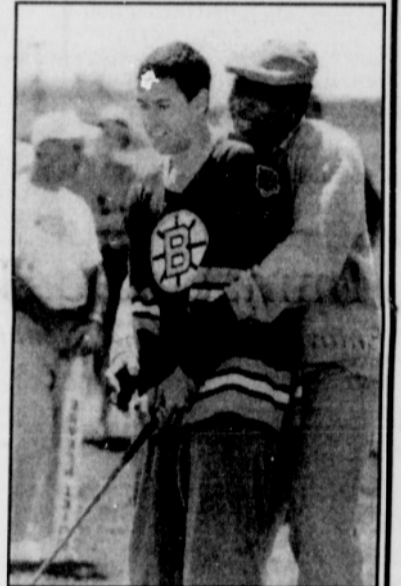
Happy Gilmore & Chubbs Peterson in "Happy Gilmore"

When it comes to a physical role, who better to call than Carl Weathers. After all, he's the action-adventure hero who looms large over the land for his portrayals of heavyweight boxing Apollo Creed in the first four Rocky films opposite Sylvester Stallone, the Special Forces/CIA operative in Predator opposite Arnold Schwarzenegger and his own urban law enforcement hero Action Jackson.