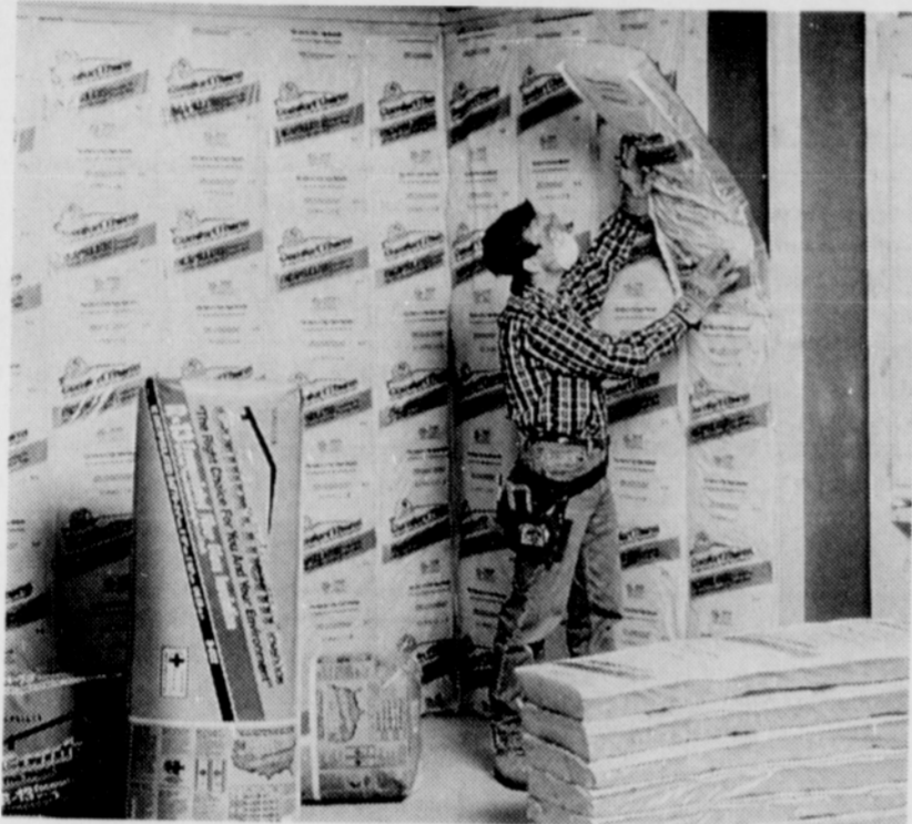
Schuller's new ComfortTherm batts are encapsulated to protect against itch and dust.

Factory cuts also save time and reduce potential itch and dust generated from job-site cutting.