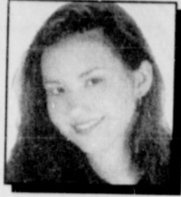
BY SABRINA SAKATA

use that would otherwise lie idle and abandoned. It gives possibility and potential to things normally unattainable to the average person. This also occurs on a grand scale of nations. Africa, Asia, and South America by various institutions such as the International Bank for Reconstruction and Development. However, borrowing money and credit to finance overambitious development plans was also fundamental factor in leaving a large number of nations with a burden of a heavy debt. In many cases, these debts would become insupportable when interest rates went up and many country's commodity export prices took sharp declines. Thus, the economies suf-