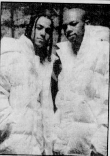
Kris Kross: Chris Smith Chris Kelly

(Chris Kelly, now 17 and Chris Smith, now 16) blew up in '91 as the two