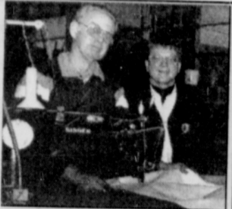
See Metro, inside.

Alberta Street firm is producing a waterproof awning for north Portland's Cathedral Park concerts.