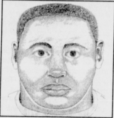
Robbery suspect #1 seen.

Portland Police Bureau detectives, in cooperation with Crime Stoppers, are asking for your help in identifying and apprehending the suspects responsible for a robbery. On Wednesday, November 1, 1995, at about 8:00 in the morning, two subjects entered the Cash Connection check cashing service at 2929 SE Powell Boulevard. The suspects confronted an employee at gunpoint, and forced her into the rear of the store. One subject removed money from a cash register while the other forced the employee to open the vault. After obtaining a substantial amount of cash, the suspects fled on foot. No vehicle was