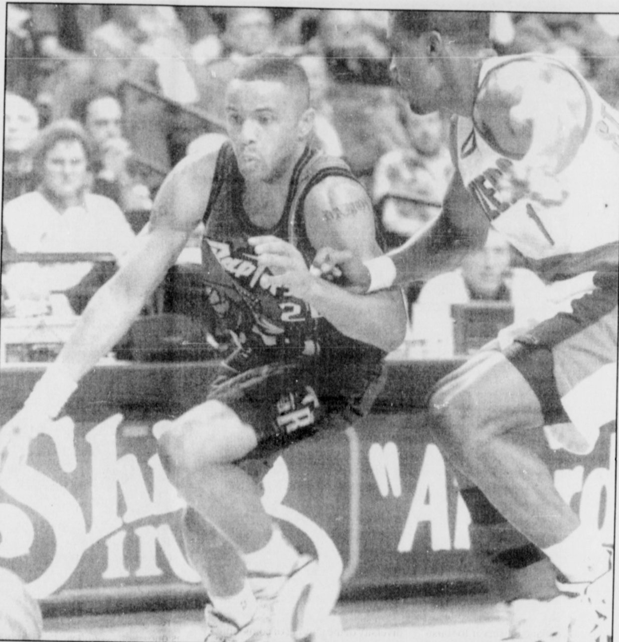
Former Portland prep star Damon Stoudamire, now a Toronto Raptor, is a leading candidate for Rookie-Of-The-Year in the NBA.