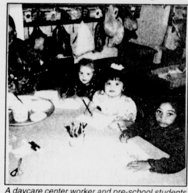
A daycare center worker and pre-school students.