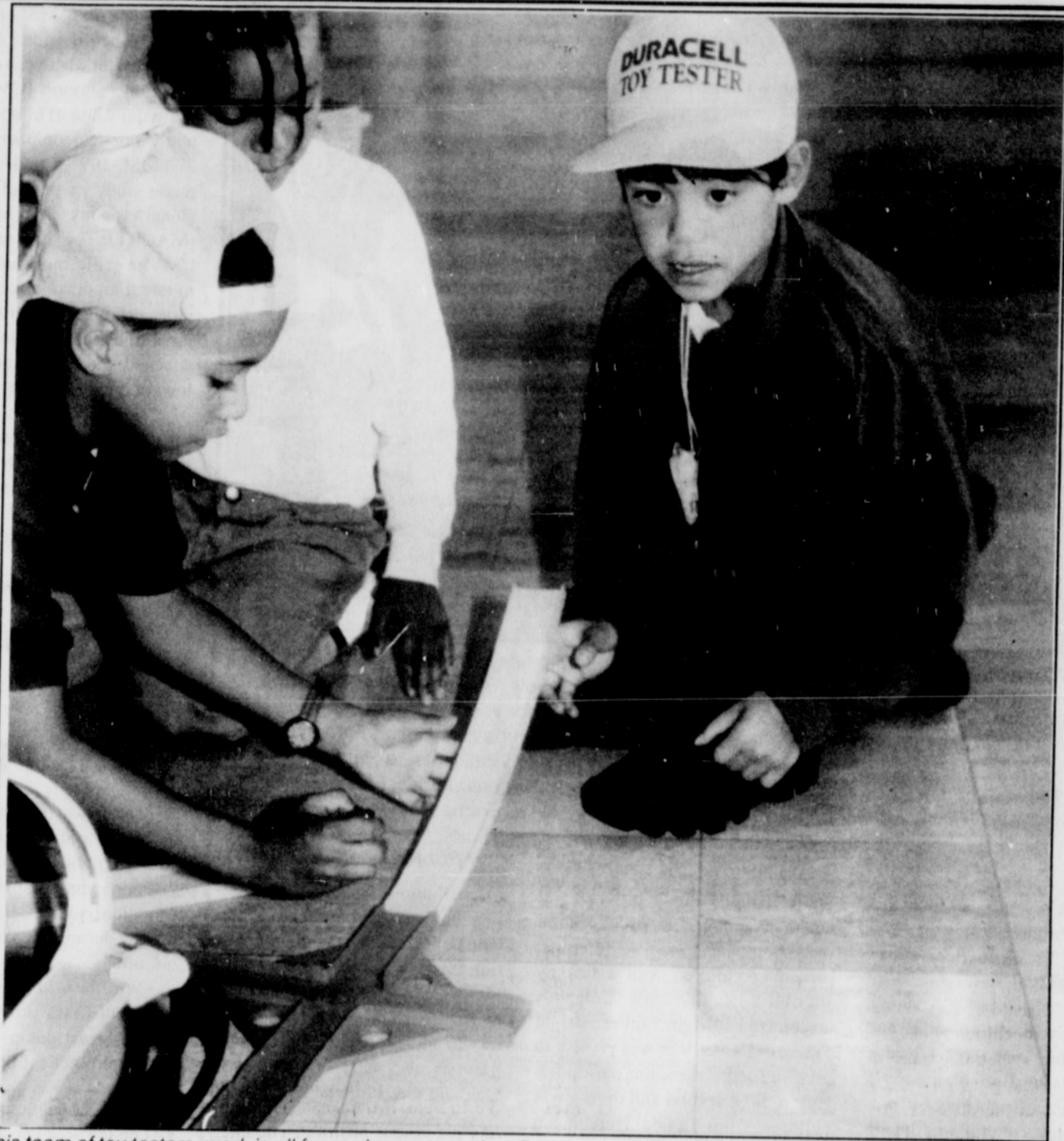
For this team of toy testers, work is all fun and games, as they figure out which of 24 new toys is their favorite in the 8th annual Duracell Kids' Choice National Toy Survey. Results are available by calling Duracell's toll-free hotline, 1-800-BEST TOYS.

Volunteers are needed to collect, sort and package food and to staff the telephones for families who need help. If you can help, call St. Vincent de Paul at 234-5295 or 234-1114. If you need help, call 232-9797.