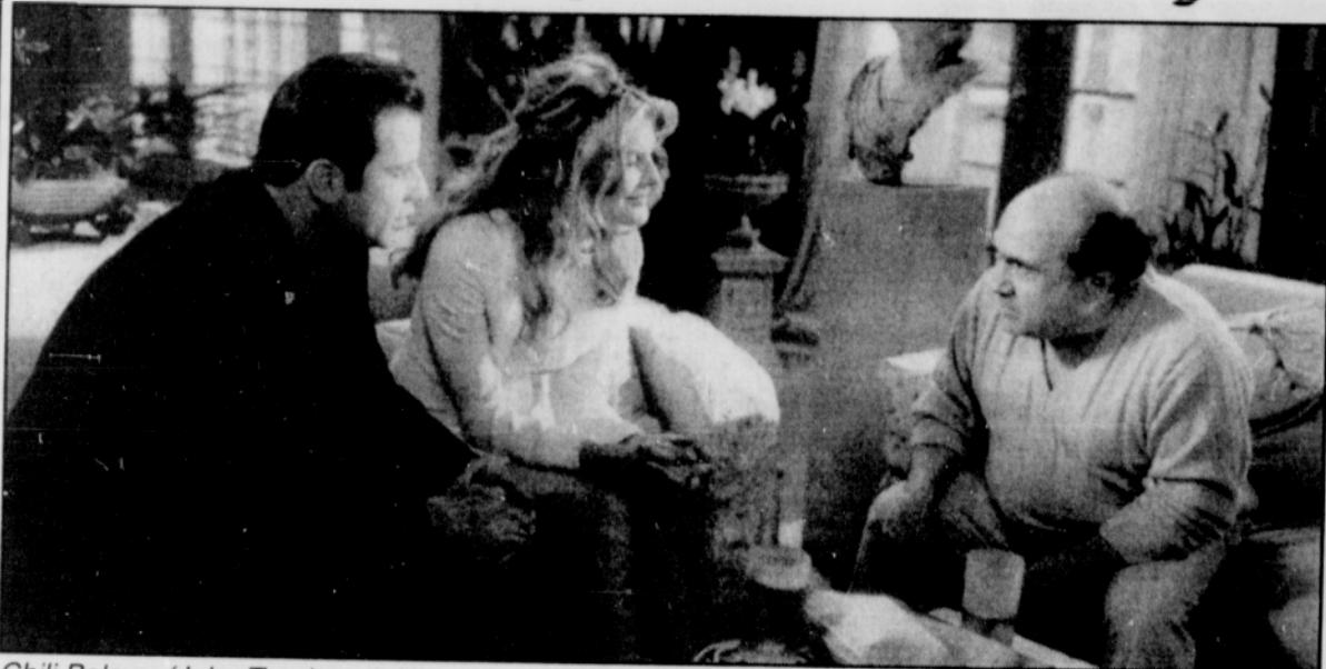
Chili Palmer (John Travolta, left) and Karen (Rene Russo, center) team up to try and persuade Karen's ex-husband Martin Weir (Danny DeVito, right) to star in their movie, in MGM's contemporary comedy Get Shorty.

John Travolta redeems his star status as Chili Palmer, the gentleman gangster in "Get Shorty". Shorty has to be Danny DeVito as Martin Weir who Palmer and his ex-wife Karen (Rene Russo) tries to persuade Weir to star in their movie.