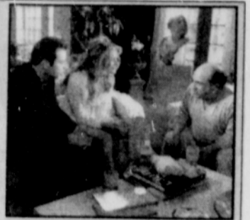
See page B3.