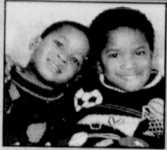
See page B2.

Adoptive family advocates put needs of children first.