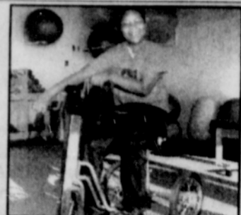
See Family Living, page B5.

Area children will get medical checkups at no cost at Portland Shriners Hospital for Crippled Children.