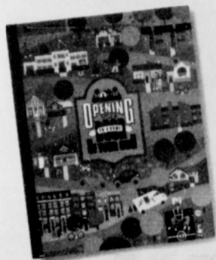
IS INSIDE HERE.

Buying your first home is a pretty big step. But with the help of Opening The Door to a Home of Your Own , an informative home buyer's guide brought to you by Fannie Mae and Washington Mutual, it can be a lot easier to take. Inside, you'll find useful advice on everything from deciding whether you're ready to buy a home, to the most effective steps you can take to get you there.