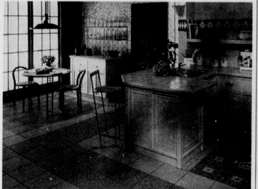
Separate two areas of a room, easily, by mixing pattern and design of ceramic floor tile. Color coordination offers easy transition. Featured is American Olean Triad™ Marble and Granite Look tile with coordinating Accent Tiles.

and where to find an American Olean Design Center 2000 dealer in your area, write to: American Olean Tile Company, Department HIT-LN, 1000 Cannon Avenue, Lansdale, PA 19446.