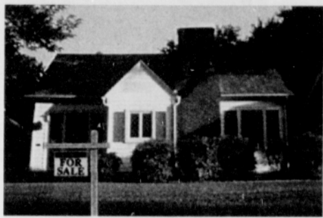
THE EASIEST WAY INSIDE HERE