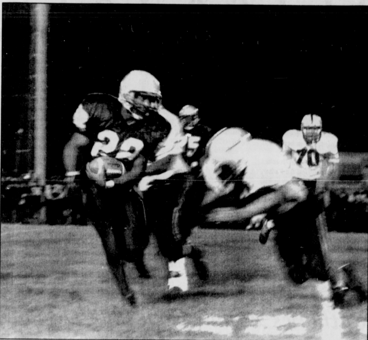
The Jefferson High offense came up big Friday night against Roosevelt as two undefeated teams met in a PIL thriller. The Democrats won the game.