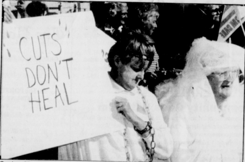
Senior citizens and others take to the street on Martin Luther King Jr. Blvd. in front of the Northeast Multicultural Senior Center Thursday to send a message protesting the cuts to medicare proposed by Congress.