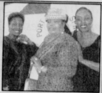
See page A6.

Area residents have fun aboard the Spirit of Portland.