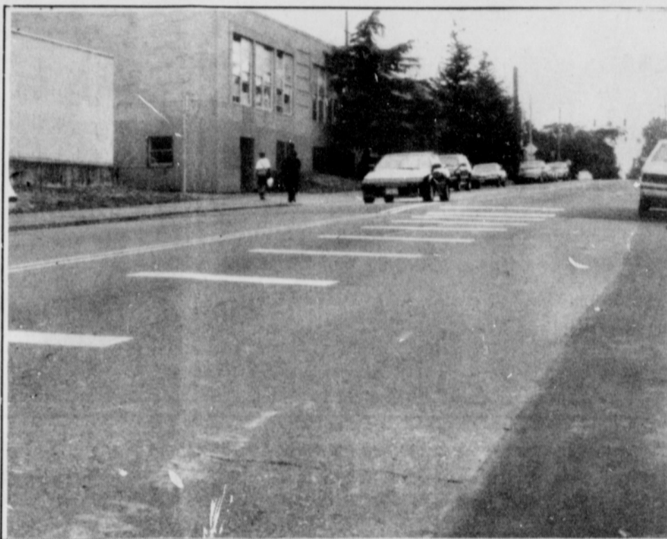
One of several speed bumps added to North Vancouver slows traffic in the block adjacent to Holy Redeemer Area School.

"One of my first priorities is to create a safe environment for children in our community," said Blumenauer, who oversees the Office of Transportation. "This means taking special actions to make sure children can get to and from school safely. The partnership between the Office of Transportation, Piedmont Neighborhood Association, Holy Redeemer and Applegate Schools, the Maintenance, Police and Fire Bureaus, parents groups and the Oregon Truckers Association shows widespread commitment to school safety and demonstrates