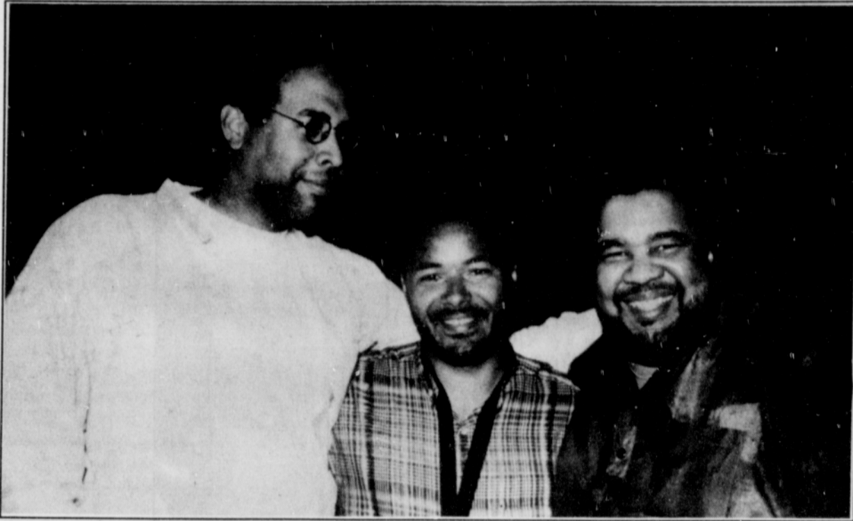
EMI Recording artist Najee becomes the filling in a instrumental sandwich as he takes time out from recording his new album, Songs In The Key of Life . The talented saxophonist is flanked by bass players Stanley Clarke (left) and George Duke (who is the producer of this project). Najee's interpretation of Stevie Wonder's 70s classic LP will be released, Fall '95.