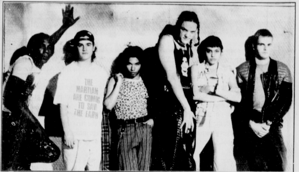
(Left to right) Lord Nikon (Laurence Mason), Joey (Jesse Bradford), Phatom Phreak (Renoly Santiago), Cereal Killer (Matthew Lillard), Kate (Angelina Jolie) and Dade (Jonny Lee Miller) are renegade computer geniuses in United Artists' fast-paced cyberpunk thriller Hackers.