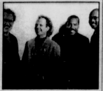
See Entertainment, Page B3.

Romantically intoxicating and soulfully sensual, Fourplay blends sounds for a third release.