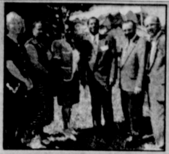
See Metro, inside.

Walnut Park Townhomes are dedicated to improve the quality of life for a culturally diverse population.