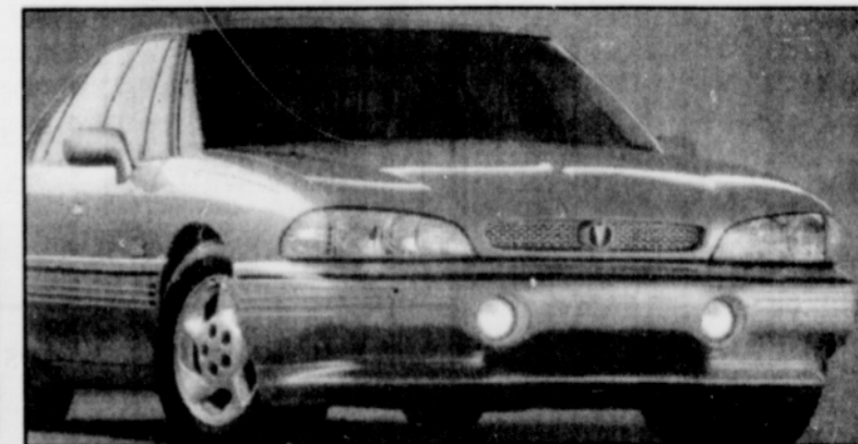
Pontiac Bonneville SSE: Heads Up-Display, Sunroof, Leather Seats, Power Windows, Power Locks, Power Mirrors, Keyless Remote Entry. Many More Extras.

4.8% Fin. for 48 months APR 3.6% Fin. for 36 months APR 1995 only in lieu of factory rebate of $750.