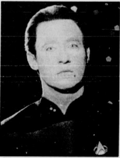
Brent Spiner as Lieutenant Commander Data.