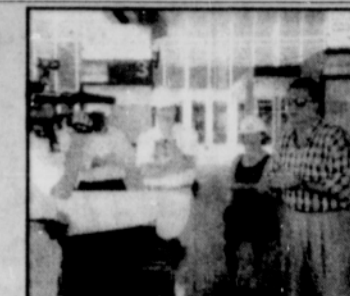
See Metro, inside.

The Rose Garden arena won't officially open until October, but the Commons at Rose Quarter are ready.