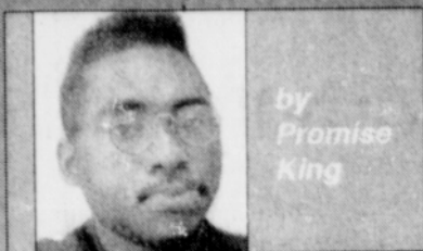
by Promise King

Before then it was Nigeria con men caught in the camera lenses defrauding white foreigners. I know by now you are wondering why and asking how did it happen that all these vices and diseases are embedded in the fabric of Africa societies?