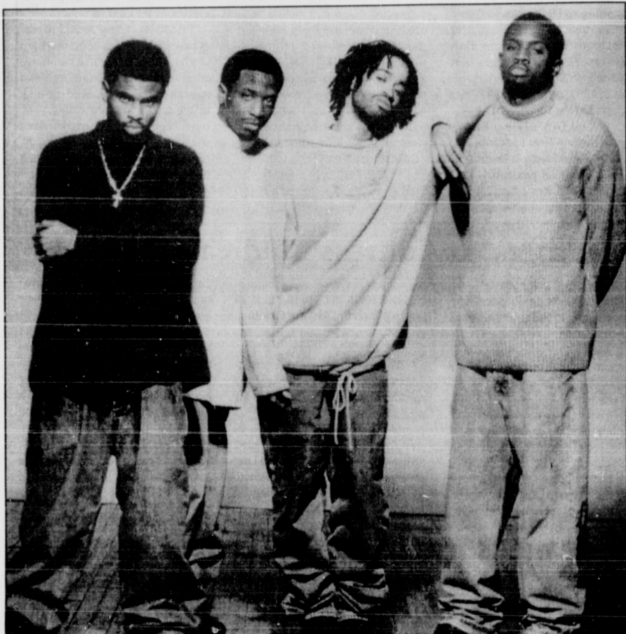
There's really no secret behind the name, explains members of the Washington, D.C.-based rap group, Questionmark Asylum. The group delivers their own unique brand of hip hop, combining traditional rhymes with a somewhat different style of melodic vocal delivery. The group's debut album is on Kaper/RCA Records.