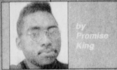
by Promise King

Before then it was Nigeria con men caught in the camera lenses defrauding white foreigners. I know by now you are wondering why and asking how did it happen that all these vices and diseases are embedded in the fabric of Africa societies?