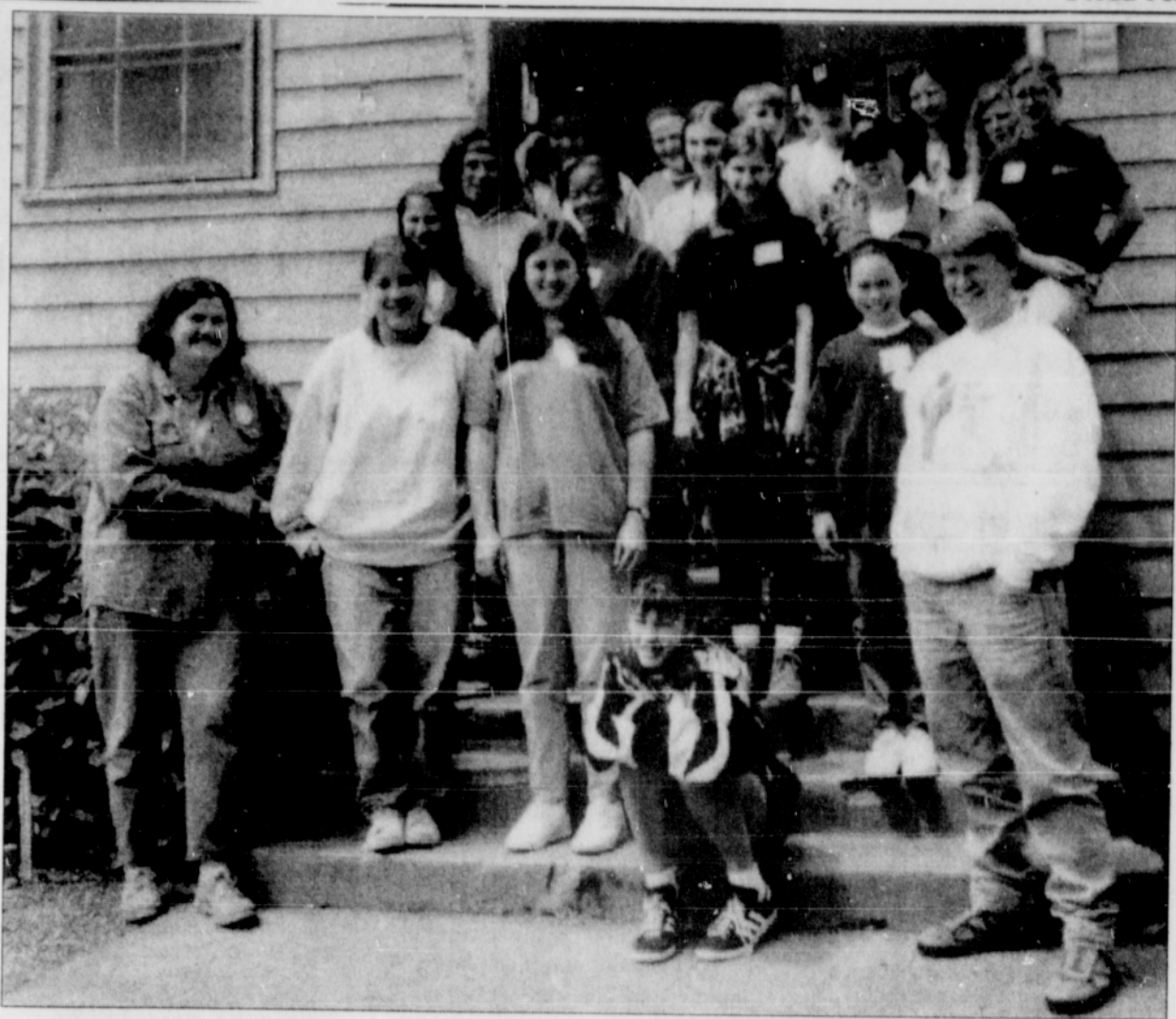
A youth action group from Portland gather after providing public service help to the community. See story on front page.

For information on the Summer Swim League and other programs offered at the Portland pools, call the pool hotline at 823-SWIM.