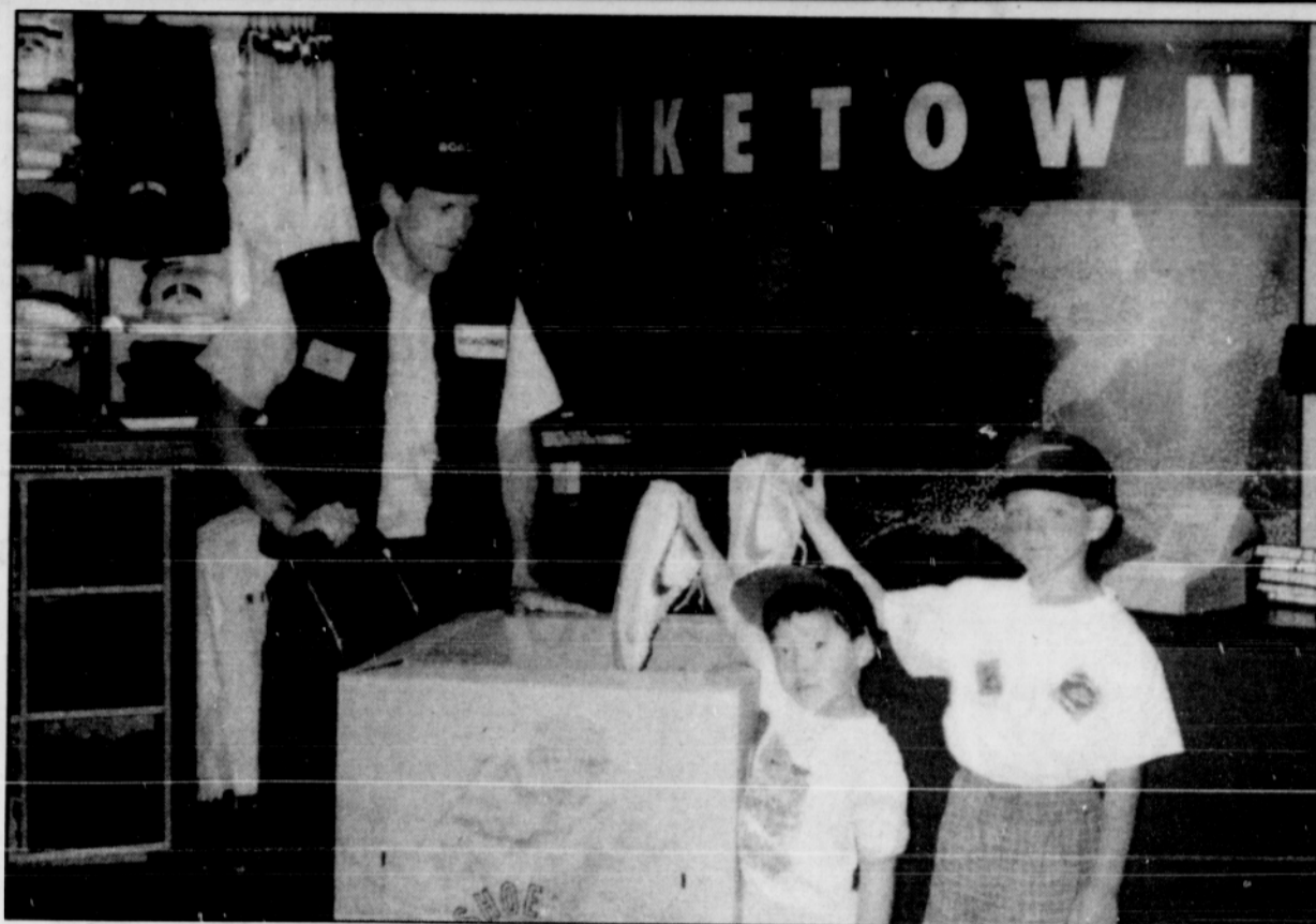
Kids pitch-in as Akron, Ohio shipper Roadway Express, teams up with Nike, Inc. of Beaverton for the "Reuse-A-Shoe" recycling campaign. The shoes will be shredded into materials for resurfacing public playgrounds, basketball courts and running tracks.

To learn more about adoption and the children awaiting homes, contact The Special Needs Adoption Coalition at The Boys and Girls Aid Society, (503) 222-9661.