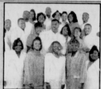
See Religion, page B5.

The New Life Community Choir is dedicated to making a positive impact.