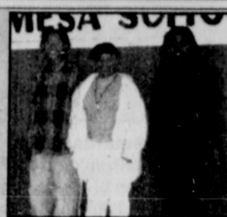
See Careers special section, inside.

Outstanding students prepare for engineering and science technology careers.