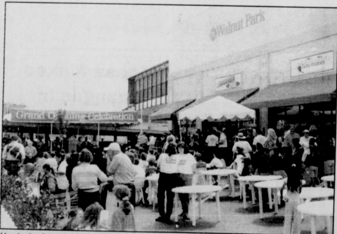
Hundreds of people enjoyed the center's grand opening at the corner of northeast Killingworth and Martin Luther King Jr.