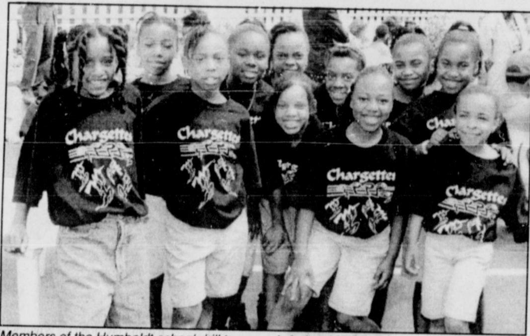
Members of the Humboldt school drill team and choir performed at Saturday's festivities.