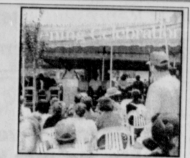
See Metro, page B1.