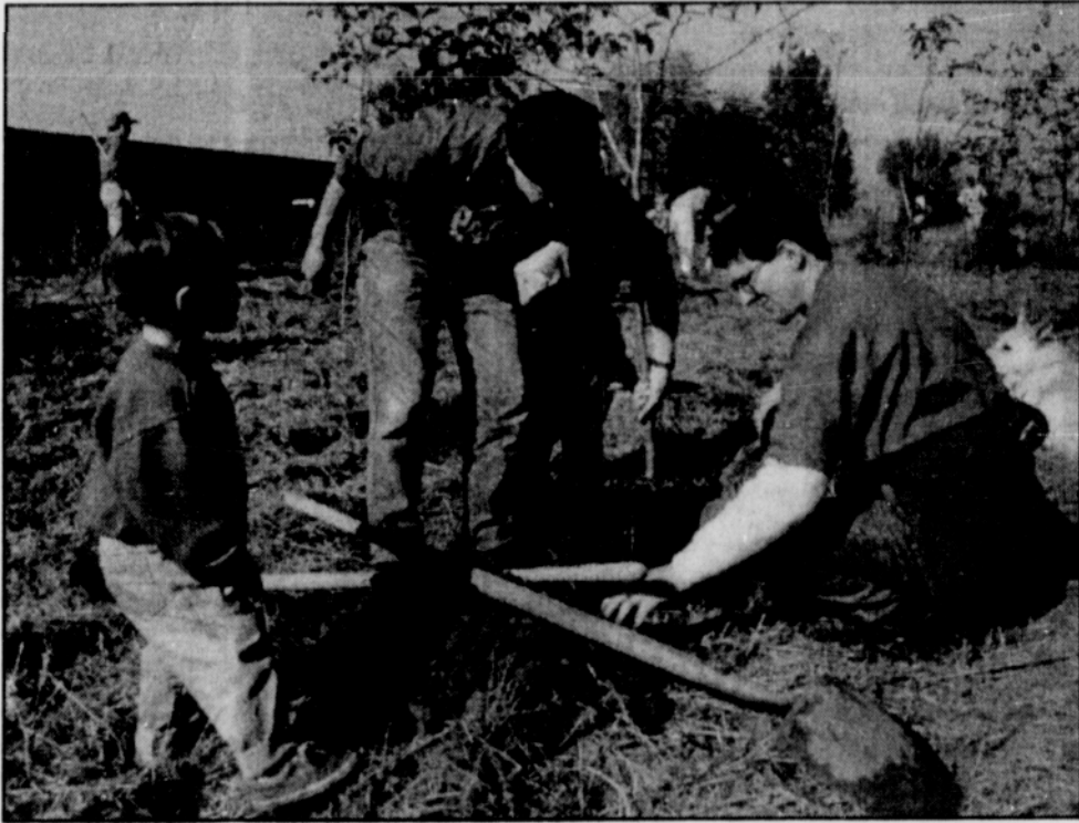
Pacific Power Co. employees join Friends of Trees volunteers in a recent tree planting at the Columbia Slough in northeast Portland. The effort was the fifth planting led by Pacific Power employees and one of many going on around the Portland area, including last weekend's plantings in the King neighborhood.

In all, more than 200 King neighborhood residents took advantage of the plant