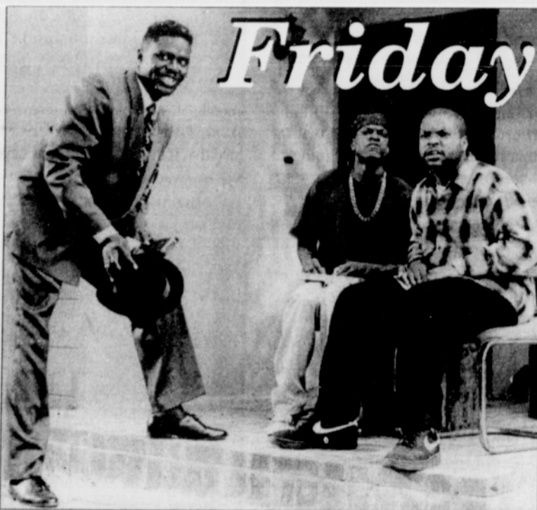
(Left) Nia Long plays Debbie, a beautiful fitness instructor; (right) Pastor Cleaver (Bernie Mac, left), Smokey (Chris Tucker, center) and Craig Jones (Ice Cube, right) catch a glimpse of their beautiful neighbor in New Line Cinema's comedy, Friday.

Friday chronicles one loooooong day in the life of Craig Jones (Ice Cube), a South Central homeboy who's trying his best to sidestep the pitfalls of growing up in the 'hood'. Despite having lost his job -- on his day off -- Craig is having trouble with his insanely jealous girlfriend, and his best friend Smokey (Chris Tucker) is in the middle of a shady deal that's gone sour.