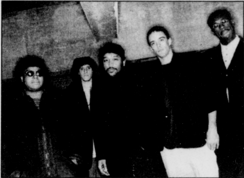
Dave Matthews Band

Those die-hard fans have also snapped up copies of the band's self-released debut, Remember Two Things (over 130,000 copies since its fall 1993 release) -- a remarkable feat, considering the album was independently distributed. While the band notes that the first release may have hinted at their potential, they are satisfied that Under The Table And Dreaming , their RCA debut --