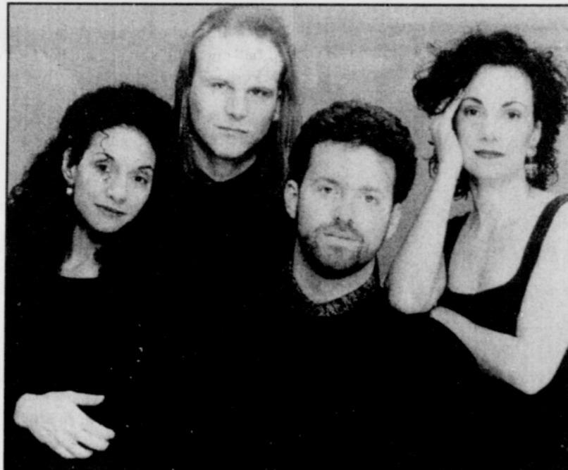
New York Voices

The voices continue to tour intensely with their stellar instrumental trio, and are in constant demand from Moscow, Russia to Moscow, Idaho. In addition to their concerts and clinics, the Voices have recently embarked on several new projects, including performances with symphonies and big bands. Their latest success with a large ensemble occurred at Carnegie hall in September of 1994, when they performed with the great Count Basie Orchestra on a spectacular program featuring the legendary Lena Horne.