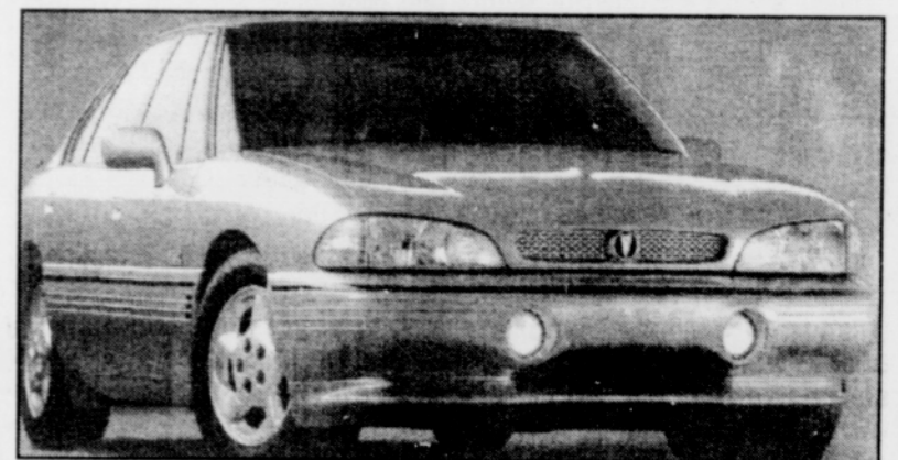
Pontiac Bonneville SSE: Heads Up-Display, Sunroof, Leather Seats, Power Windows, Power Locks, Power Mirrors, Keyless Remote Entry. Many More Extras. PS 222 1995 SE "Save" $3122.00