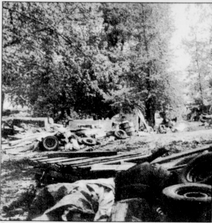
For years, illegal dumping has marred natural areas in north and northeast Portland. A May bond election would pay for clean-up and protect them as parks.

and jog amid some of the most beautiful views on the Willamette River. An accompanying trail would link the cove to Smith and Bybee Lakes.