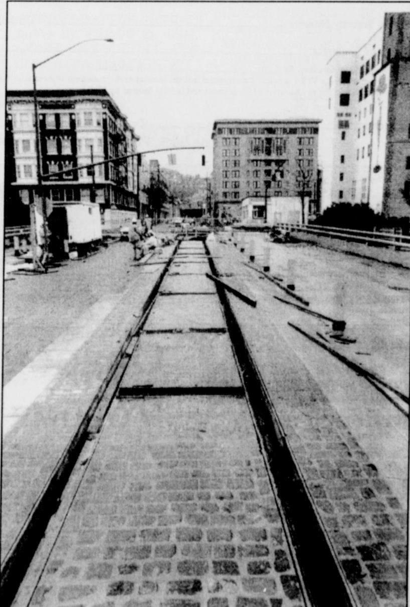
Cobblestones, brick and light rail track are appearing along Southwest Yamhill as part of the Westside Max project. The downtown stretch from 11th to 17th with rebuilt street, sidewalk and trackbed is expected to be complete in May. Then work will then move to Southwest Morrison.

The plan outlines $5 million in immediate track rehabilitation needs and addition $17 million in needed long-term improvements.